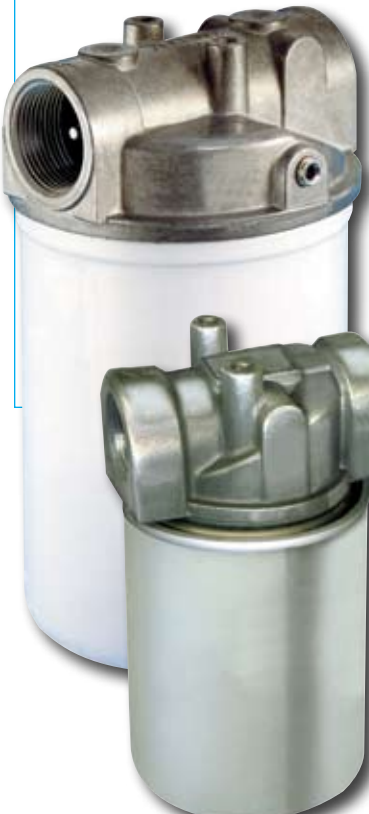
MODEL FEF-51 Element area 950 sq. in. Flows up to 60 GPM (return)