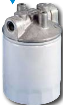
MODEL FEF-30 Element area 510 sq. in. Flows up to 25 GPM (return)